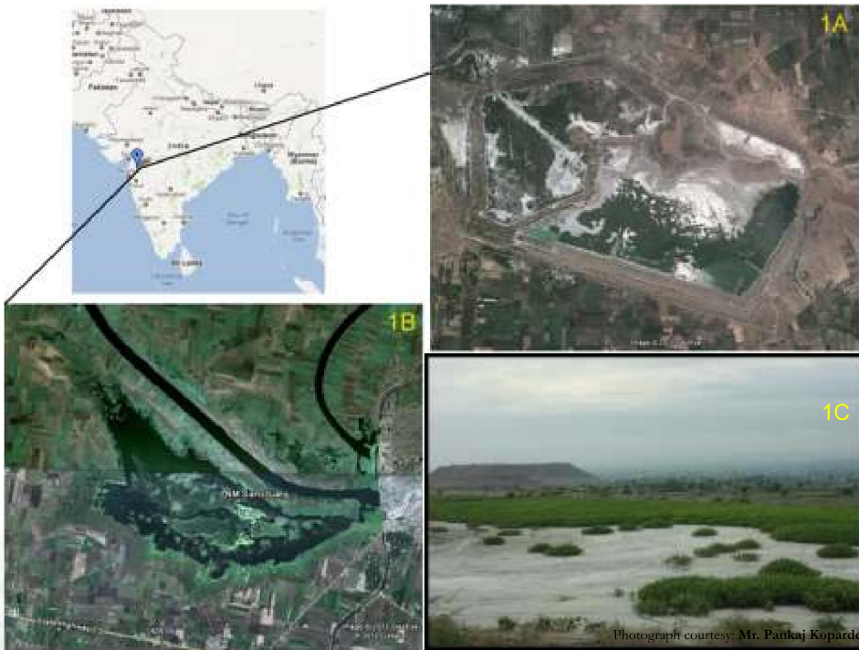
Fig. 1: Satellite Map of study sites (Google maps). 1A: Satellite map of FAPs. White patch shows dried FAP, green patch shows Ipomoea sp. Growth over FAPs. 1B: Satellite map of NMBS. Dull black color shows backwater of the dam and green patches show small islands formed in the backwater. 1C: FAP Landscape when it dries up.

pers. Observation), Comb duck and Greylag goose. During the surveys, we encountered many instances wherein we could watch courtship and nesting behavior of several bird species (Figure 3). We were able to locate nesting of Wire tailed swallows, Coots, Spotbills, Baya weaver birds and White breasted waterhen. It is evident from these sightings that FAPs act as a breeding ground for many resident as well as few of the migratory birds.